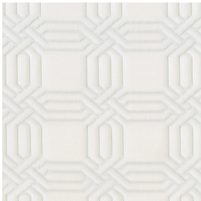
©2017 BRENTANO, INC. PATTERN AND DESIGN