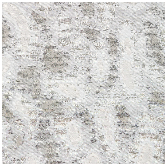
PATTERN AND DESIGN