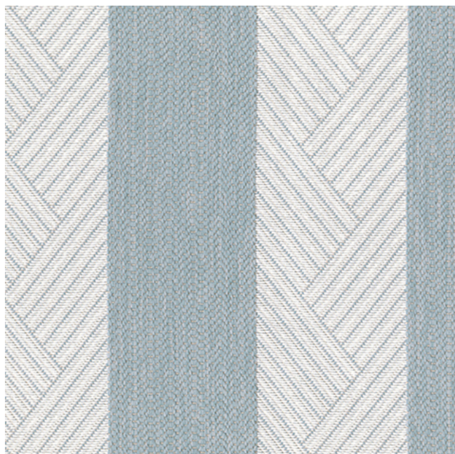
©2017 BRENTANO, INC. PATTERN AND DESIGN