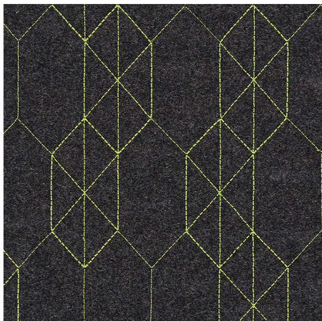
©2017 BRENTANO, INC. PATTERN AND DESIGN