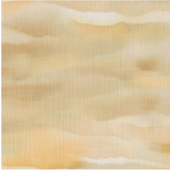
©2017 BRENTANO, INC. PATTERN AND DESIGN