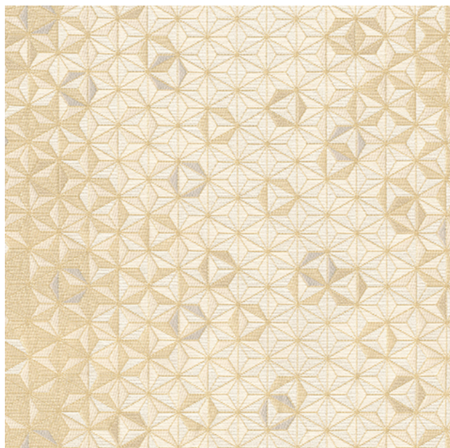
©2017 BRENTANO, INC. PATTERN AND DESIGN