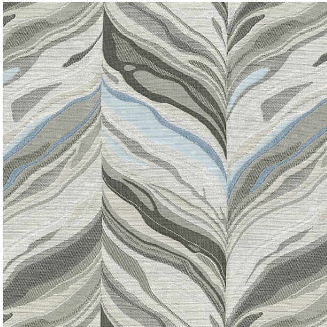
©2017 BRENTANO, INC. PATTERN AND DESIGN