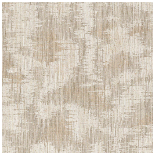
©2017 BRENTANO, INC. PATTERN AND DESIGN